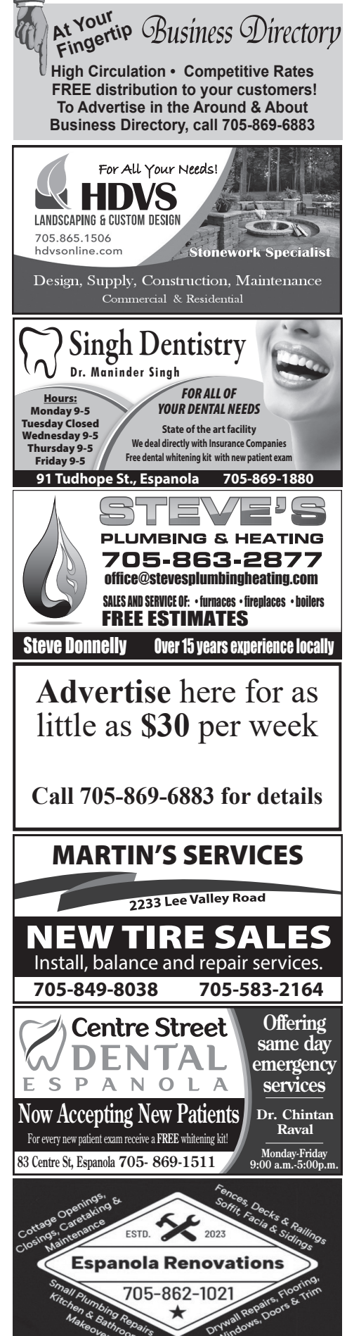
Around&About August 13, 2024 Page 2