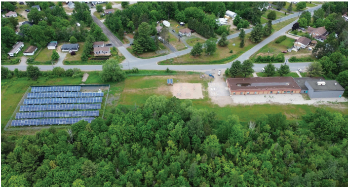
Photo - École Sainte-Anne, Spanish

The Conseil scolaire catholique Nouvelon is pleased that its commitment to increasing its energy efficiency has not gone unnoticed. In fact, CSC Nouvelon ranked 3rd in the Sustainable Schools' 2024 Top Energy Performing School Boards Report that measures the energy efficiency of Ontario school board for the 2021-2022 school year. The 72 school boards in the province were ranked on their energy savings potential, which is the gap between their target and current energy consumption values. This achievement is the result of ongoing initiatives established since 1990 to implement improvements to CSC Nouvelon buildings. These efforts include the collaboration of janitorial and maintenance staff members who ensure the optimal operation of systems, the integration of green