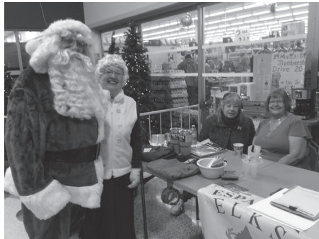
Photo - A long-time tradition continues once again this year with the 48th Annual Espanola Elks/Moose Hamper Fund.