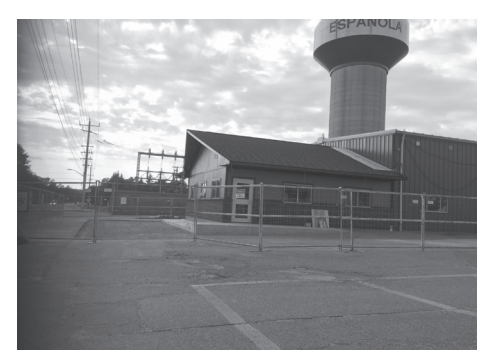
Photo - The barriers are down in more ways than one at the Espanola Public's Work office. Despite some small adjustments, a major revamp of the space including having it meet accessibility requirements, has been essentially completed. The office is now reopened to the public for inhouse inquiries.

The public can now receive assistance in the revamped office space.