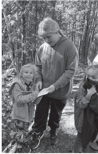
Photo - La Renaissance students observe the seasonal changes while exploring Black Creek Trails.

Grade 1, 2 and 6 students from École catholique La Renaissance in Espanola had the pleasure of exploring Black Creek trails. During this outdoor activity, the youngest students were paired with their peers from grade 2 or 6 to observe the seasonal changes that occur in Autumn. With the help of their mentor, students noted their observations and discussed their discoveries with enthusiasm. It was a wonderful learning activity filled with discoveries and growing friendships!