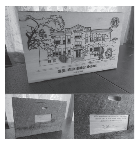
Photo - Want a unique piece of Espanola history. A local illustrator has etched an original design of AB Ellis Public School in wood recovered from the demolition site. Go to Facebook, Enter Leeney Illustration and Design Co. and message your order. $75 plus tax each. Photos provided

By Rosalind Russell - A local illustrator and former student of an Espanola school has made a limited edition of plaques featuring the former AB Ellis Public School.