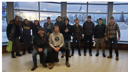
Photo 1 - The Baking Competition was held at Espanola High School with a top finish for local students.